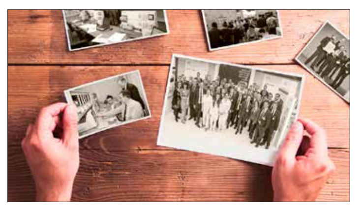
Stories that shine a special light on the achievements of #KNXis30

After all the news about Covid-19, we all can need a little sunshine in those difficult times. But nobody has expected that the April actions of #KNXis30 would come with such a blast. In April, KNX Association cherished those moments that became immortal memories. Presenting the 41 most valuable game-changers in the history of KNX Association, the KNX Community did us the honour to vote for their favourite memory of all time. And the result surprised big times. Let's have a look at the highlights that the month of April of #KNXis30 brought us.