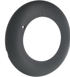
Cover ring PD2N FC Art.No: 93771

Battery: 3.0 V Lithium CR2032 (inclusive) Dimensions: 57 x 35 x 7 mm Material color: -