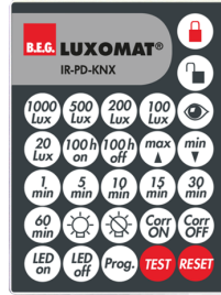
IR-PD-KNX Art.No: 92123

Dimensions: Ø 200 x 90 mm Impact strength: IK09 Housing: coated steel basket