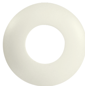
Cover ring PD9 Ø 45 mm Art.No: 92327

Dimensions: Ø 36 mm Housing: polycarbonate, UV-resistant Material color: silver glossy