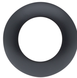
Cover ring PD9 Ø 36 mm Art.No: 92235

Battery: 3.0 V Lithium CR2032 (inclusive) Dimensions: 57 x 35 x 7 mm Material color: -