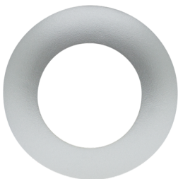
Cover ring PD9 Ø 36 mm Art.No: 92237

Dimensions: Ø 36 mm Housing: polycarbonate, UV-resistant Material color: white glossy