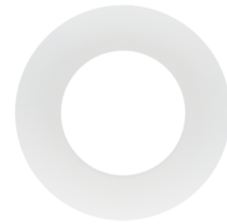
Cover ring PD9 Ø 36 mm Art.No: 92238

Dimensions: Ø 36 mm Housing: polycarbonate, UV-resistant Material color: anthracite glossy