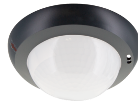
Corridor lens PD4N type A, Cover ring Art.No: 93741

Detection area: horizontal 360° (Ceiling mounting) Range: max. &Oslash; 40 m across<br>max. &Oslash; 20 m towards Monitored area (tangential movement): 250 m 2 / 2.5 m mounting height