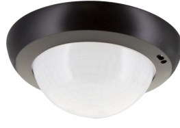
lens PD4N, Cover ring Art.No: 93733

Detection area: horizontal 360° (Ceiling mounting) Range: max. &Oslash; 24 m across<br>max. &Oslash; 8 m towards<br>max. &Oslash; 6.4 m seated Monitored area (tangential movement): 450 m 2 / 2.5 m mounting height