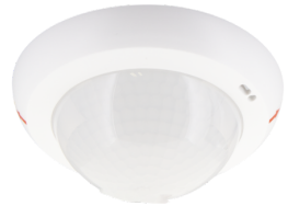
Corridor lens PD4N type A, Cover ring Art.No: 93742

Detection area: horizontal 360° (Ceiling mounting) Range: max. &Oslash; 40 m across<br>max. &Oslash; 20 m towards Monitored area (tangential movement): 250 m 2 / 2.5 m mounting height