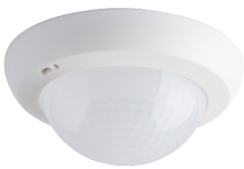
Corridor lens PD4N type A Art.No: 93073

Detection area: horizontal 360° (Ceiling mounting) Range: max. &Oslash; 24 m across<br>max. &Oslash; 8 m towards<br>max. &Oslash; 6.4 m seated Monitored area (tangential movement): 450 m 2 / 2.5 m mounting height