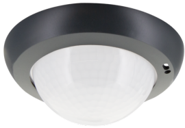
lens PD4N, Cover ring Art.No: 93731

Battery: 3.0 V Lithium CR2032 (inclusive) Dimensions: 57 x 35 x 7 mm Material color: -