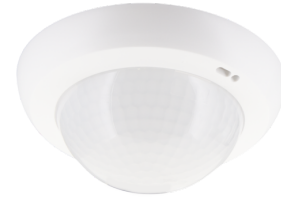
lens PD4N, Cover ring Art.No: 93732

Detection area: horizontal 360° (Ceiling mounting) Range: max. &Oslash; 24 m across<br>max. &Oslash; 8 m towards<br>max. &Oslash; 6.4 m seated Monitored area (tangential movement): 450 m 2 / 2.5 m mounting height