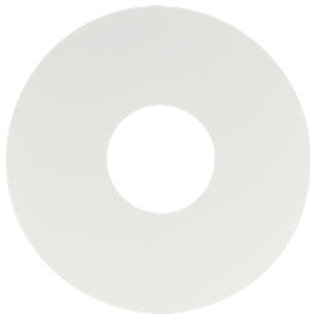
Cover ring PD11 Art.No: 92692

Dimensions: Ø 52 x 3 mm Housing: polycarbonate, UV-resistant Material color: black glossy, similar to RAL9011