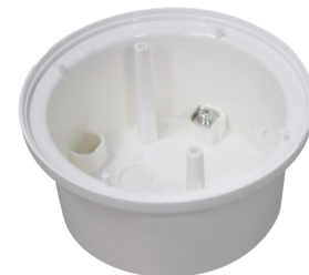
Surface mounting socket PD11 Art.No: 92121

Dimensions: 54 x 54 x 2.6 mm Housing: polycarbonate, UV-resistant Material color: white mat, similar to RAL9010