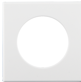
Square design frame PD11-FC Art.No: 92994

Dimensions: Ø 100 x 3 mm Housing: polycarbonate, UV-resistant Material color: white mat, similar to RAL9010