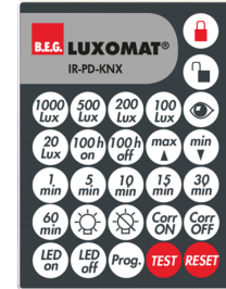
IR-PD-KNX Art.No: 92123

Dimensions: 47 x 19 x 10 mm Degree / class of protection: IP20 Ambient temperature: -20 °C to +40 °C