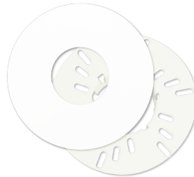
In-wall mounting set / PD11 Art.No: 92833

Battery: 3.0 V Lithium CR2032 (inclusive) Dimensions: 57 x 35 x 7 mm Material color: -