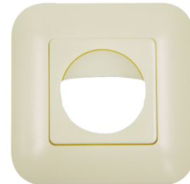
Frame IP20 Indoor 180 Art.No: 92632

Dimensions: 87 x 87 mm Degree / class of protection: IP54 Housing: polycarbonate, UV-resistant