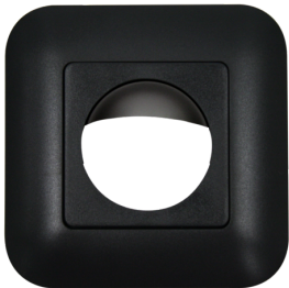
Frame IP20 Indoor 180 Art.No: 92634

Dimensions: 86 x 86 mm Degree / class of protection: IP20 Housing: polycarbonate, UV-resistant