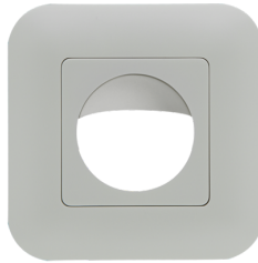
Frame IP20 Indoor 180 Art.No: 92630

Battery: 3.0 V Lithium CR2032 (inclusive) Dimensions: 57 x 35 x 7 mm Material color: -