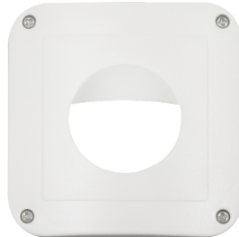
Frame IP54 Indoor 180 Art.No: 92139

Dimensions: 86 x 86 mm Degree / class of protection: IP20 Housing: polycarbonate, UV-resistant