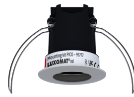
Mounting set PICO Art.No: 93777

Dimensions: Ø 45 x 50 mm Degree / class of protection: IP20 Housing: polycarbonate, UV-resistant