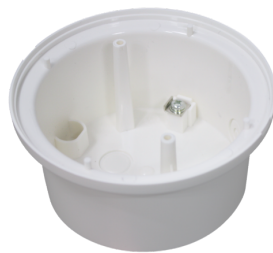
Surface mounting socket PD11 Art.No: 92121

Dimensions: Ø 52 x 3 mm Housing: polycarbonate, UV-resistant Material color: black glossy, similar to RAL9011