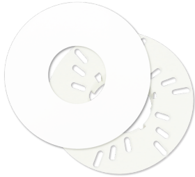
In-wall mounting set / PD11 Art.No: 92833

Dimensions: 40 x 55 x 103 mm Material color: black Frequency: 2.4 GHz ISM band, GFSK 0.2 dBm + 5.3 dBi = 5.5 dBm