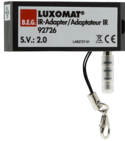
IR-Adapter for Smartphones Art.No: 92726

Dimensions: 54 x 54 x 2.6 mm Housing: polycarbonate, UV-resistant Material color: white mat, similar to RAL9010