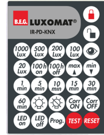
IR-PD-KNX Art.No: 92123

Degree / class of protection: IP54 Housing: polycarbonate, UV-resistant Material color: white