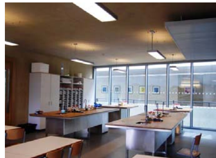
Figure 2. Energy efficiency 1: constant light regulation with KNX in the laboratories.