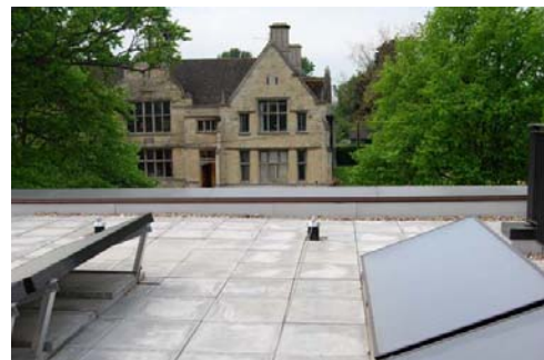
Figure 4. Sustainable resources: solar panels for the hot service water supply.

KNX Association is the creator and owner of the KNX technology – the worldwide STANDARD for all applications in home and building control, ranging from lighting and shutter control to various security systems, heating, ventilation, air conditioning, monitoring, alarming, water control, energy management, metering as well as household appliances, audio and lots more. KNX is the worldwide STANDARD for