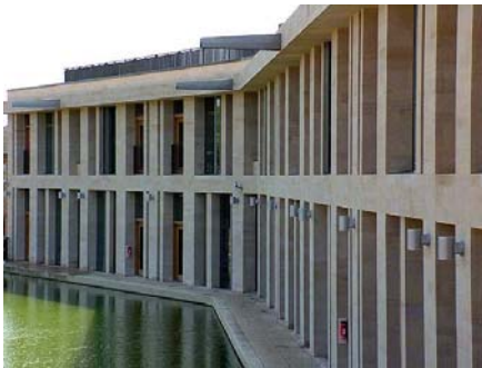
Figure 1. Oundle School's SciTec centre, which brings together science, art and technology, and which has been built with the help of future-oriented sustainable technologies such as KNX.